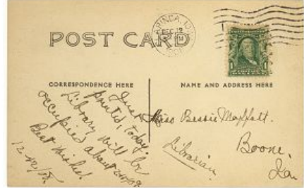
Postcard from 1909 as the Carengie Library was being built.