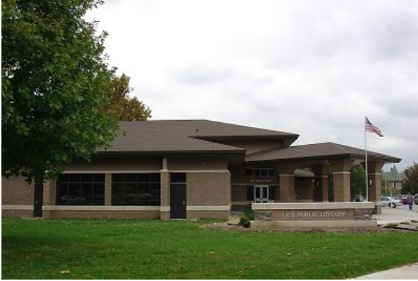
The Lied Public Library was built in 2004